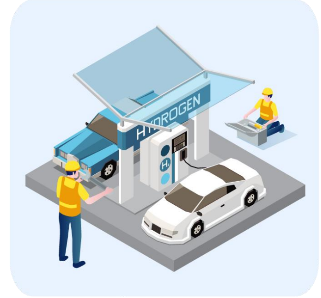
Ensuring Process Safety Management