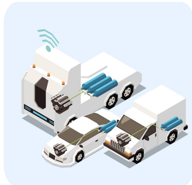
High Energy Consumption for Hydrogen Production with Current Technologies