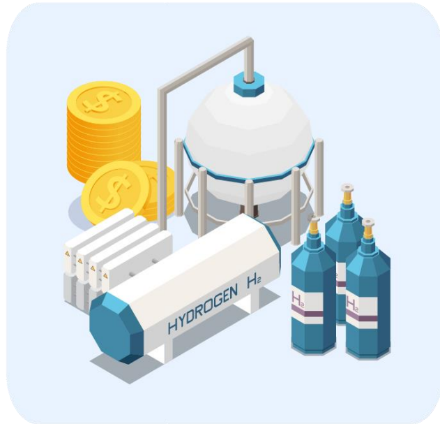
Current High Cost of Hydrogen Value Chain